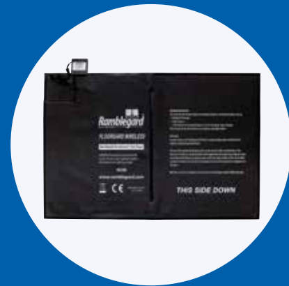
Ramblegard® Floorgard This wireless floormat will trigger an alarm when the user steps onto the mat.