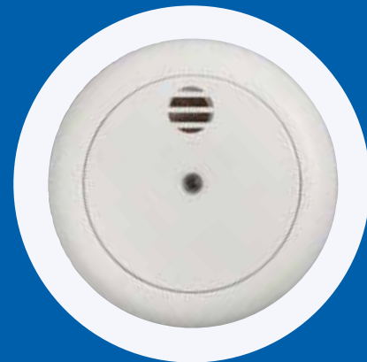
Fire Alarm Automatically sends an emergency alarm signal to the monitoring centre.