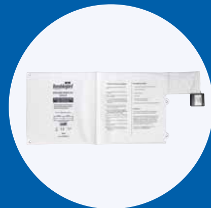
Ramblegard® Bedgard This wireless pad will send out an alert if the user attempts to sit up or get out of bed.