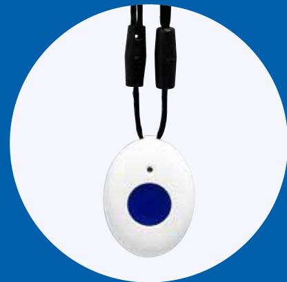
High-Performance Pendant Lightweight personal alarm trigger can be worn around the neck.

The alarm unit also supports a variety of other wireless sensor devices including; pendant and fall triggers, bed and chair sensors, door keypads and many more.