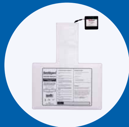
Ramblegard® Seatgard Wireless for use on top of or under a cushion, it will trigger an alert when pressure is released.