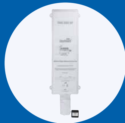
Ramblegard® Wireless Under Mattress Placed under the mattress, the wireless pad will send out an alert if the user attempts to sit up or get out of bed.