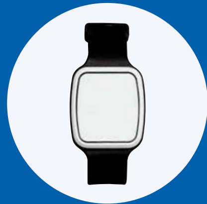
Wrist-Worn Fall Detector A discreet way of wearing a fall sensor. Includes an integrated alarm button.