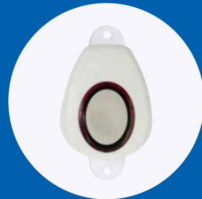
Bogus Caller Button Next to the front door or bedside allows the user to raise the alarm.