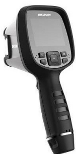
Body temperature measurement camera